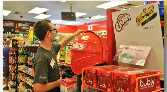
A sophomore student completing student internship at Fastrip in Taft.

TIL organized a few events this semester including a reunion of previous graduates and an open house for special educators and social workers.