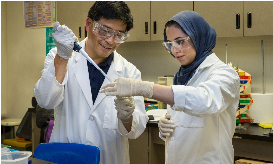
An American River College student and her instructor in the lab.

In May 2009, the California Community Colleges Board of Governors approved changes to California Code of Regulations, title 5, §53407 and §53410 to allow the creation of a third option within the minimum qualifications to be defined requiring a bachelor's or associate degree in a specific discipline, plus requisite years of professional experience. The four types of discipline lists contained in this handbook are identified on the opposite page.