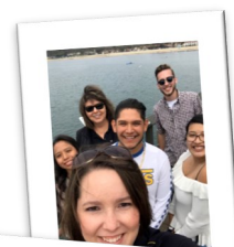
Summer Institute 2018